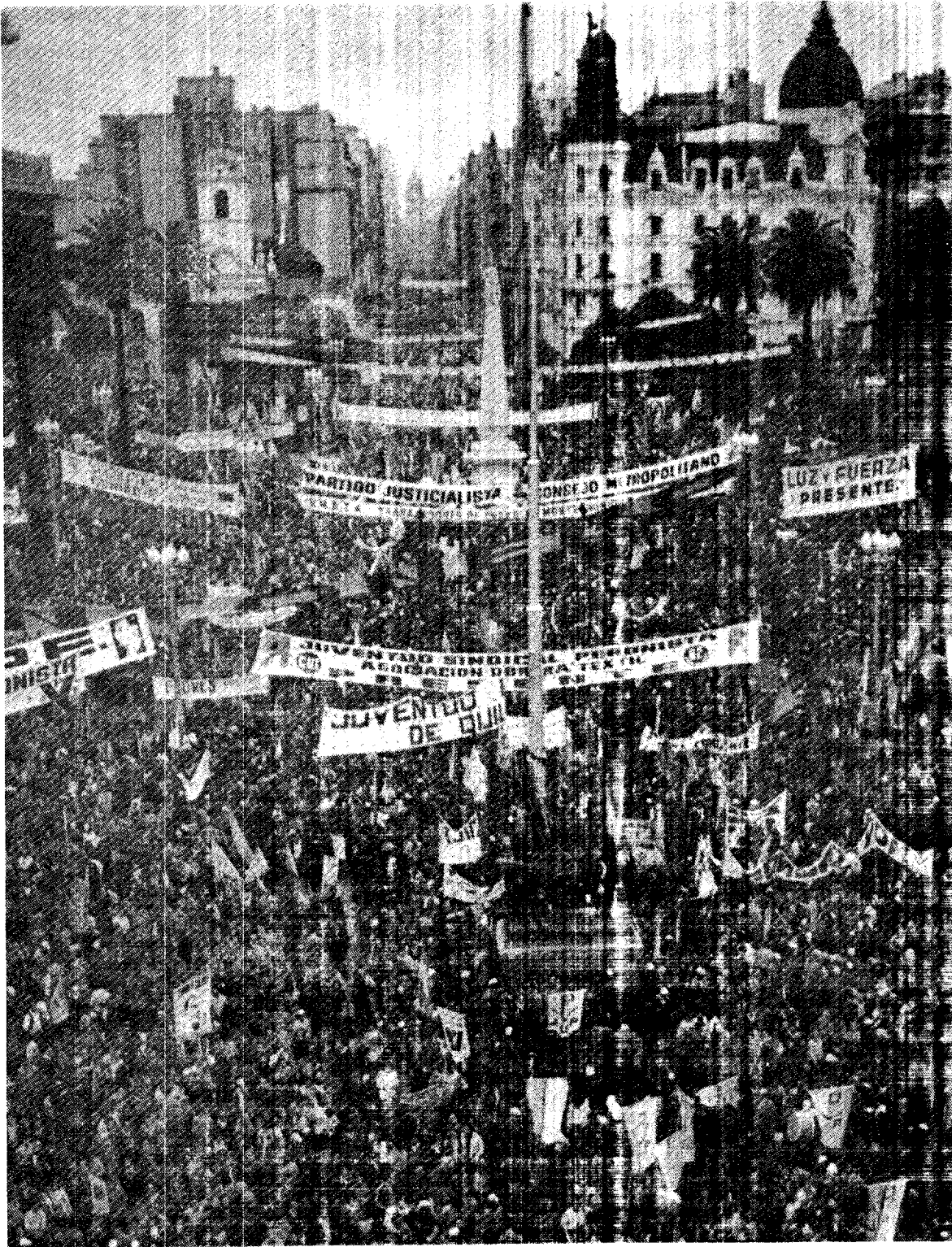
A massive Peronist rally in government square. Many of the groups have since turned against the government of Mrs. Peron.