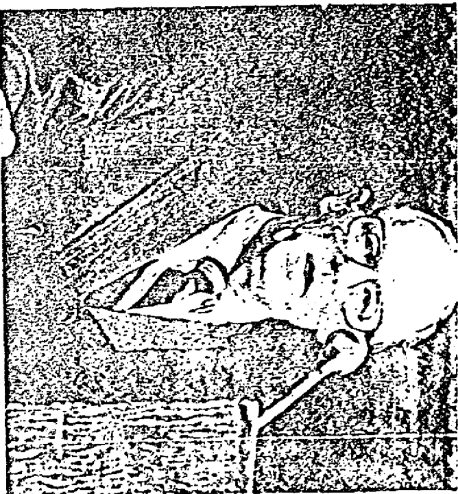
E. Howard Hunt—he'll be thrown to the wolves

But once again, the "good folks of Middle America" will be hoodwinked by a limited hangout, and the truth will be kept from them. The CIA and HSCA are being set up to witness yet another