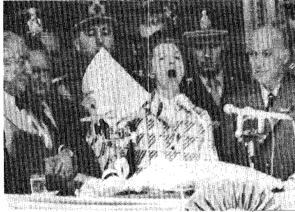
President Peron In need of support

There is no effort under way to persuade her to do so and none is anticipated, but the consensus among the cross section of officers surveyed is that Argentina would be better off with another president, especially if the military had a hand in the selection. This is a major shift