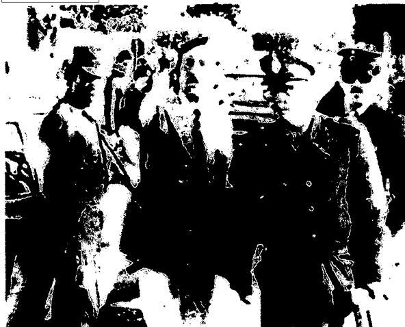
Searching operation against Argentine terrorists