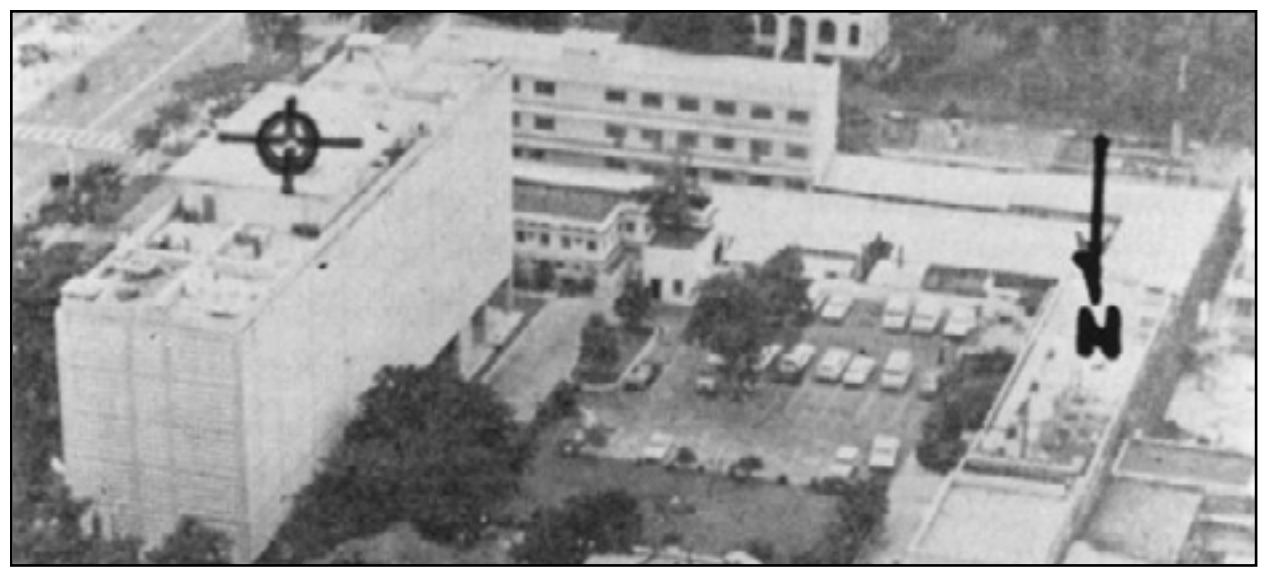
The embassy evacuation plan included multiple contingencies, such as identifying possible helicopter landing zones at the embassy if the airport was not accessible—which is exactly what happened.

to the North provided impetus for both the war's commencement and its continuance. Ultimately, 2 million Americans served and more than 58,000 American lives were lost in the Vietnam conflict.<sup>c</sup>