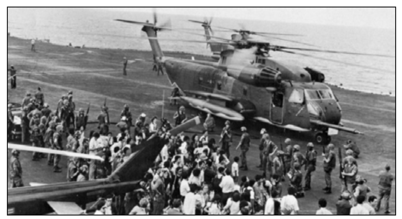
Evacuees boarded military helicopters, such as this one on the USS Midway, in nearly nonstop waves. The goal was to get as many people out as possible.

so he could] evacuate as many people as he possibly could. That's not a delay in the evacuation so [much] as it's a delay in the cessation of the evacuation. It's the ending of the evacuation—that's what he delayed. That's what he bought time on.