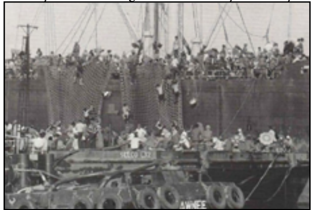
In their desperation, local Vietnamese used any means of transportation available to leave the country—including riverboats and barges.

DO Case Officer: We did not get out a lot of the agents that the Agency had scattered around the country. One of the agents that actually saved my