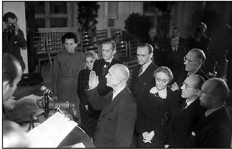
Ferdinand Friedensburg, far right, looks on as Otto Ostrowski takes the oath of office as mayor of Berlin, November 26, 1946.

The short-lived liberal attempt to establish a pan-German party catapulted Heuss to the front line of the early Cold War. The Soviet-backed Communist Party in the eastern occupation zone sought to turn the local branch of the Liberal Party into a subservient tool, and Külz did nothing to fend off the communist takeover. Faced with the choice of either turning his back on the Western