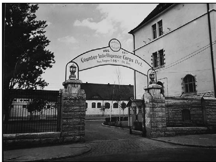
The Wallace Barracks, headquarters of Region I of the 66th Counter Intelligence Corps Detachment in Stuttgart.