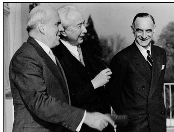
US High Commissioner John J. McCloy, President Theodor Heuss, and the former US military governor of Germany, General Lucius D. Clay (ret.)

Heuss returned the favor by promoting the creation of a pro-Western German state and by defending US policy, especially through contributions to the Rhein-Neckar-Zeitung . The intelligence section of the Information Control Division, which regularly surveyed local opinion on American-licensed newspapers, must have been pleased at the following comment: "A merchant