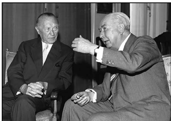
Konrad Adenauer and Theodor Heuss, 1959.

office of the military government in Württemberg Baden took careful note of Heuss's anti-communist rhetoric in the local parliament. In July 1948, the office reported approvingly on Heuss disparagement of the Communist Party in Württemberg-Baden. 44