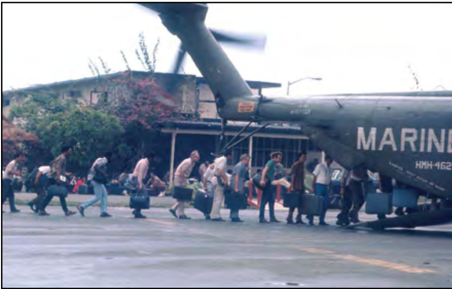
US civilians boarding a Marine Corps CH-53 Sea Stallion helicopter for flight to waiting ships of the 7th Fleet in mid April 1975.