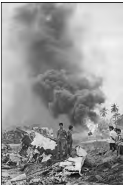
South Vietnamese soldiers standing guard at the site of the crash of the US C-5A transport on 4 April 1975.

My state-side boss, General Lew Allen, the director of NSA, ordered me to close down the operation and get everyone out before somebody got killed, but the ambassador wouldn't hear of it. I made him a proposition: if he would let my people go, I would stay in Saigon until the end with a skeleton staff to assure