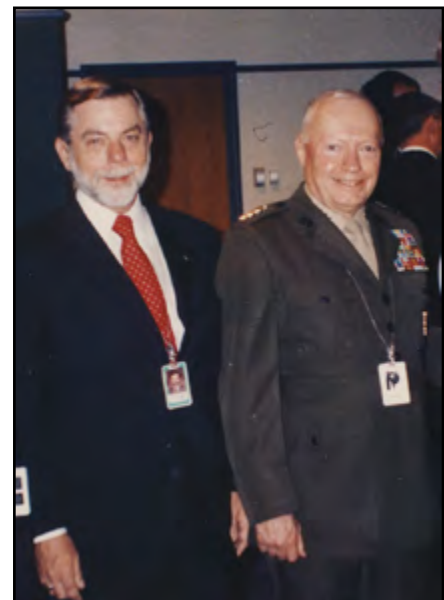
The author with Gen. Al Gray, USMC. Undated photo © author.

Someone found out I spoke Vietnamese and asked me to broadcast a message on a common frequency tell-