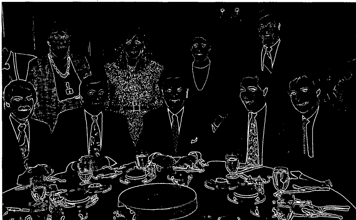
Senate Select Committee on Intelligence (SSCI) luncheon in 1993. The committee's chairman at that time, Senator David Boren, is seated in the center. Seated second from the left is the SSCI's then staff director, George Tenet (now DCI). The author of this article is seated at the right. Others shown are SSCI staff members.

whether the judgments reached by the analyst are sound, or why this is something Congress needs to know. They sometimes ask if briefing the Congress can be delayed until an ongoing initiative with an affected foreign government can be completed or until that government can be officially advised. It is not uncommon for a policymaker to elevate these issues directly to the top of the intelligence agency concerned.