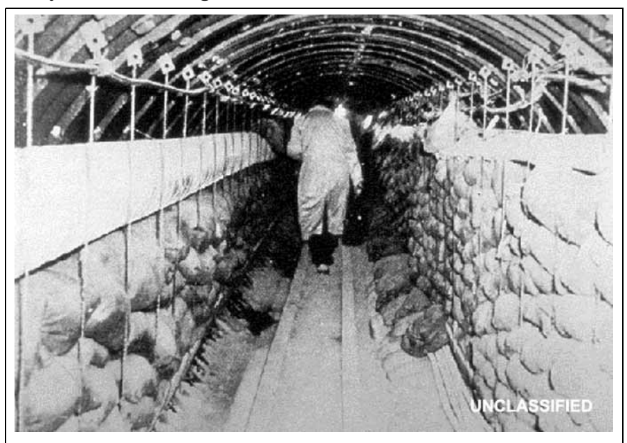
Tunnel interior with wooden rails for forklift and sandbag "benches" for utility lines and ventilation ducts.

The operation of the shield resulted in an overcut of 2 1/2 inches. This provided space for the liner plates, but left a 1/2-inch void between the tunnel and the undisturbed earth above. This void had to be filled in order to prevent subsidence of the earth above the tunnel. About every fourth liner-plate ring had "grout plugs," threaded cores that filled holes used for pumping grout into the void. The plugs were screwed