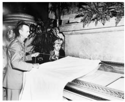
Gen. Jonathan M. Wainwright (1883–1953) unveils surrender documents at US National Archives exhibit, September 12, 1945.

Lamar found the two in a nearby shack, stripped and kneeling on the floor, surrounded by Japanese with bayonets; then he, too, was grabbed, slapped around, bruised by the flat