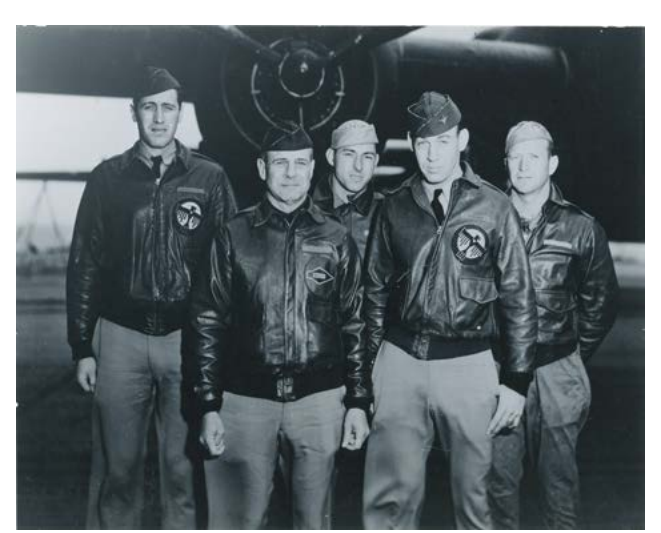
Lt. Col. Jimmy Doolittle (second from left) and the crew of the plane he piloted in the raids over Tokyo on 18 April 1942.

Cunningham, who headed Naval and Marine forces on Wake Island and was captured when that island was attacked immediately after the attack on Pearl Harbor. Four of the famous Doolittle fliers also were found. Captured after their one-way, April 1942 raid on Japan, these were the only survivors of the eight crew members originally taken prisoner. Treated as war criminals, they had been tortured, starved, and kept in solitary confinement. Three were executed, and a fourth died of starvation and disease. Of the four who remained. one was so near death from beriberi that he couldn't be included in the first group of POWs flown out. Lapsing in and out of consciousness, and becoming increasingly psychotic, he was treated by Jarman in a hotel room converted to hospital use until he became sufficiently stable to be moved to Kunming.15