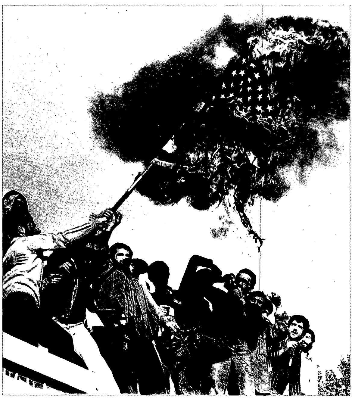
Iranian demonstrators burn American Flag on wall of US Embassy shortly after takeover by militants in November 1979.