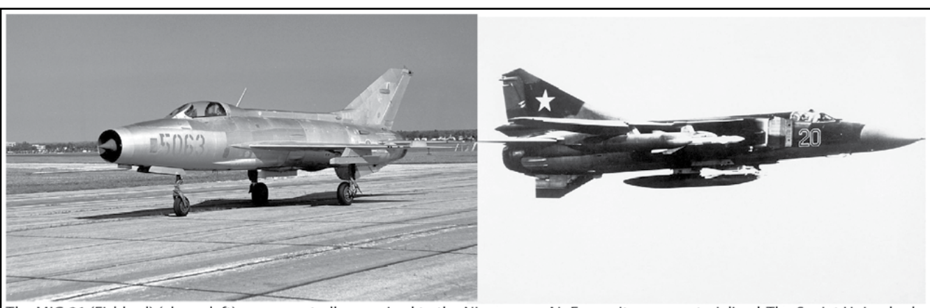
The MiG-21 (Fishbed) (above left) was repeatedly promised to the Nicaraguan Air Force. It never materialized. The Soviet Union had supplied fighter/interceptor aircraft—MiG-23 Floggers (above right)—to Cuba, and there existed concern that some would be shipped to Nicaragua.