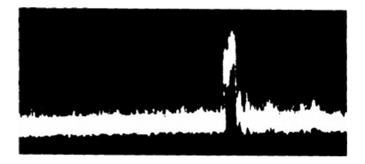
Figure 1. Oscillograph traces of three consecutive pulses spaced 20 seconds apart. Each transmitted pulse was 800 microseconds long. The top trace shows considerable lengthening of the trailing edge. The middle one shows degradation of the rise time. The bottom trace most closely resembles the shape of the original transmitted pulse.

In practice, we unfortunately have somewhat less time than that to look at this radar; it may not be operating during those brief periods when we look for it. Being a research device, it can be expected to be "down" a large portion of the time. The Soviets might even avoid letting its beam hit the moon, in order to prevent our intercept of the signals. Research radars are the most important to intercept, since they give hints about what may be operational in the future.