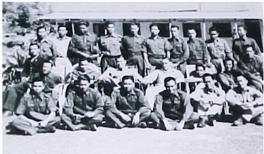
This photo of a group of Free Thai members and US officers was one of many shown in a CIA Museum exhibit in 2000 entitled "Historic Photographs and Memorabilia of Thailand's OSS Heroes. The photos and many of the artifacts have been transferred to the Thai government.

When former Free Thai were asked how they managed to get away with as much as they did in dealing with the Japanese