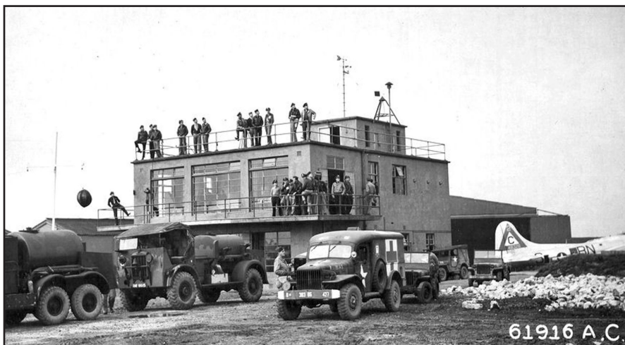
Figure 1: US Army Air Force ground personnel observing flight operations from the control tower of RAF Molesworth during WWII. Parked at the side of the building is a B-17.

Nazi-occupied Europe. One of several Class A bomber airfields built in and around Cambridgeshire was called RAF Station Molesworth after a nearby small village.