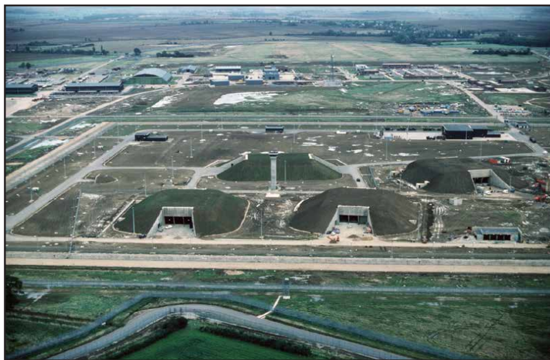
Figure 2. RAF Molesworth in 1987, showing bunkers for ground-launched cruise missiles deployed there briefly that year.

The full story of the development of US and NATO intelligence capabilities and organizations from the late 1940s until the late 1980s is beyond the scope of this article, but a short description of the intelligence architecture in Europe in 1988 provides context for Molesworth's modern development. Since WWII, US national security policy focused command authorities, responsibilities, and, particularly, resources through the Departments of the Army, Navy, and Air Force, rather than through