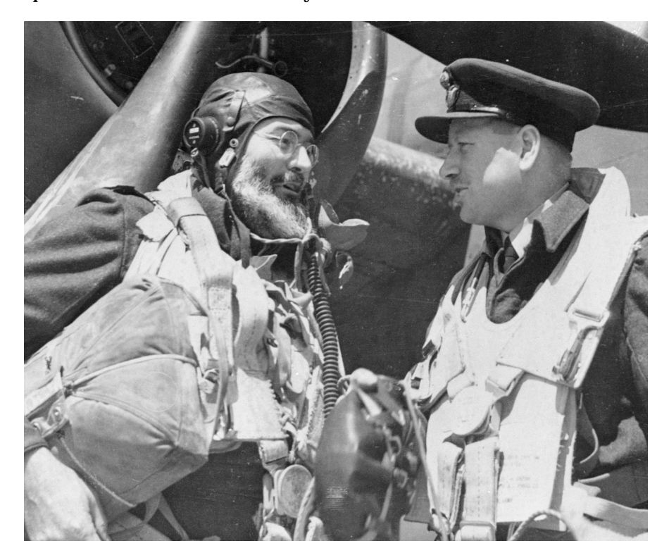
Hemingway seen just before beginning a flight over France soon after D-Day landings began on 6 June 1944.

Since Hemingway had by far exceeded his brief as a correspondent, he turned to Bruce for protection in case of "trouble," by which the author apparently meant losing his accreditation (let alone capture by the Germans, who were given to shooting combatants not in proper uniform). According to a letter that Hemingway wrote after the war, Bruce had obliged him by writing out a simple set of orders, tantamount to temporarily attaching Hemingway to the OSS. If it ever existed, this bit of paper did not survive the war; Hemingway claimed that he had destroyed it to protect Bruce.<sup>29</sup> However, there is in the Hemingway archives a somewhat