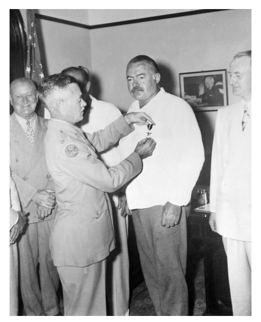
If there was any suspicion about Hemingway's involvement with the NKVD, it is not evident in this 1947 ceremony in which he was awarded the Bronze Star medal from the US Army for his service as a war correspondent.

produce. A NKVD operative met with Hemingway twice between September 1943 and April 1944 in Cuba, once in June 1944 in London, and once in April 1945 in Cuba. The NKVD file summarizes Hemingway's poor record as a Soviet spy: