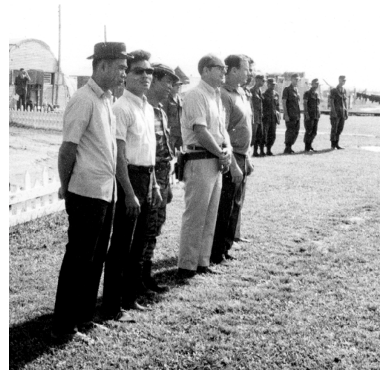
Formal military formations were rare in Tay Ninh. In this case, four members of the PRU were awarded Bronze Stars for bravery during an operation with the US Army’s 25th Infantry Division.

While my experience in Tay Ninh does not necessarily represent the experience of other PRU advisers and their units, I can say confidently that the Tay Ninh PRU was successful during my tour. From September 1969 to June 1970, the Tay Ninh PRU