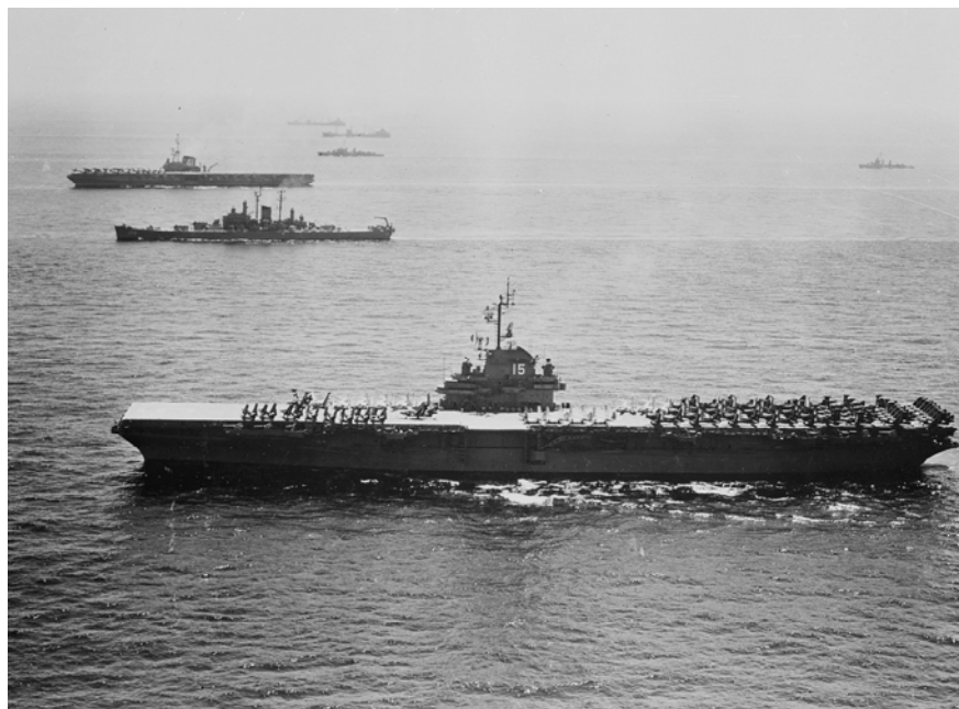
A planned NATO exercise, involving US Navy aircraft carrier battle groups shown here, allowed British and French warships to enter the region without drawing undue attention.

Thus in the late summer of 1956, the British were confronted with the very real possibility of having to fight a politically unpalatable war to repel an Israeli invasion of Jordan. Troops and aircraft for such a contingency would have to be assembled on Cyprus. This provided an ideal cover for the buildup for the