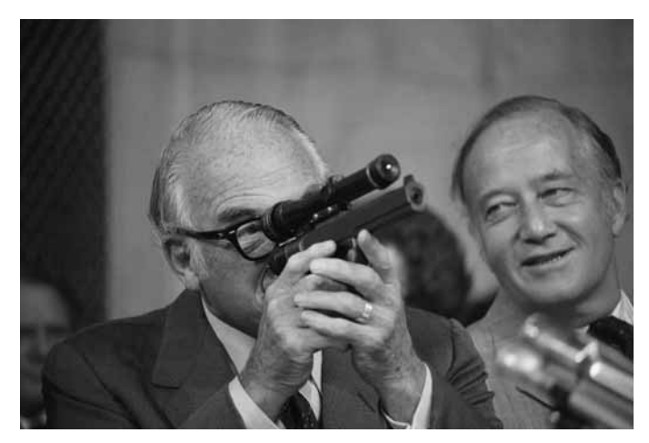
Senator Goldwater examines CIA dart gun as Senator Charles "Mac" Mathias (R-MD) looks on.