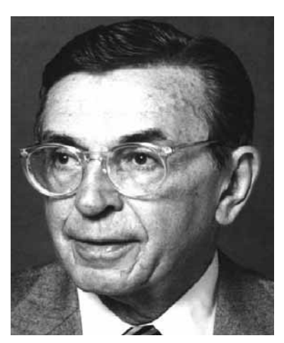
Senator Daniel Inouye (I), first chairman of the Senate Select Committee on Intelligence, and Representative Edward Boland, first chairman of the House Permanent Select Committee on Intelligence. Each was instrumental to the successful inauguration of his respective committee.