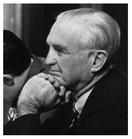
Senator Stuart Symington.

For the remainder of the decade, Agency records reflect no significant oversight by Congress of its analytical work. Apart from an appearance by DCI McCone before the SFRC in 1963 to explain the