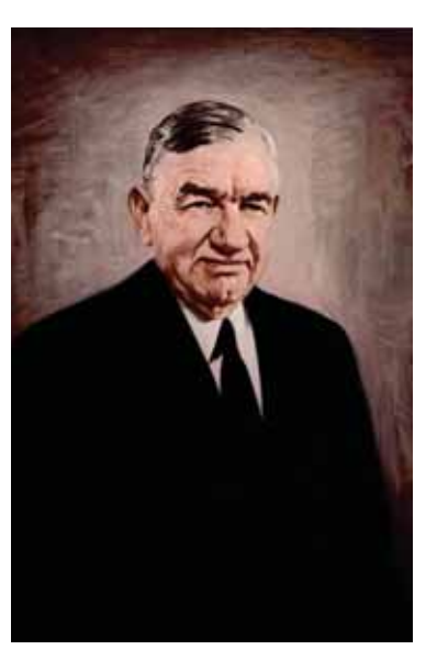
Representative Clarence Cannon, chairman of the House Appropriations Committee.

The Agency had a similar experience in the Senate that year. There was but one meeting of its subcommittees, a joint meeting of the SAC and SASC subcommittees that occurred in Russell's office in August. According to a CIA memorandum, the meeting was "completely off the record. No transcript . . . covered the world situation in considerable detail. . . . The Senators appeared to be impressed with the informa-