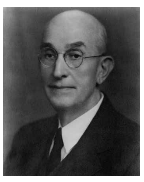
Senator Carl Hayden, chairman of the Senate Appropriations Committee.

Although its FY 1956 appropriation remained relatively flat, for the first time it had 20 percent of the Agency's funding going to "science," reflecting the new responsibilities the administration had given it, among them the development and construction of the U-2 reconnaissance aircraft, as well as the growth of its in-house technical capabilities (see chapter 8).30 Although few members of Congress were aware of the Agency's new responsibilities in this area, the leaders of the CIA subcommittees and their respec-