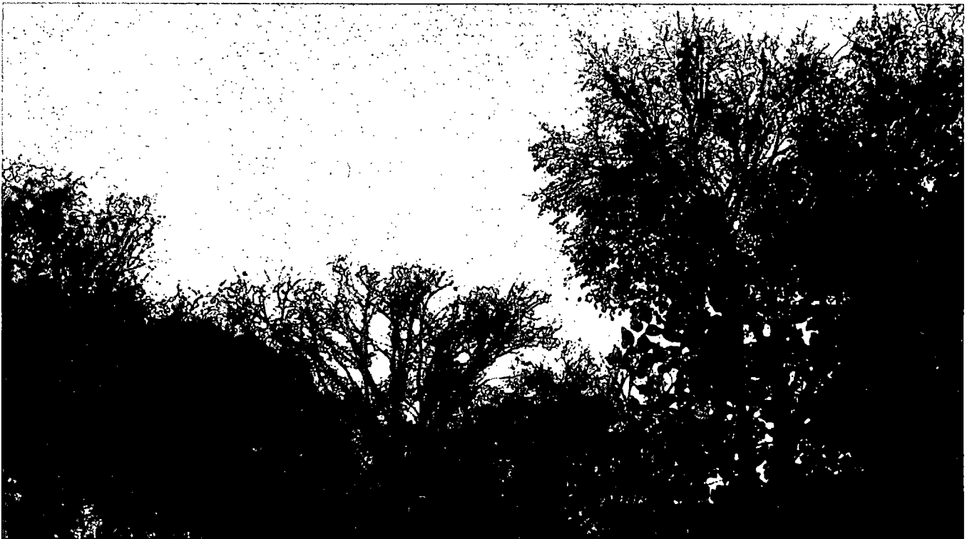
Minneapolis, Minnesota, 20 October 1960