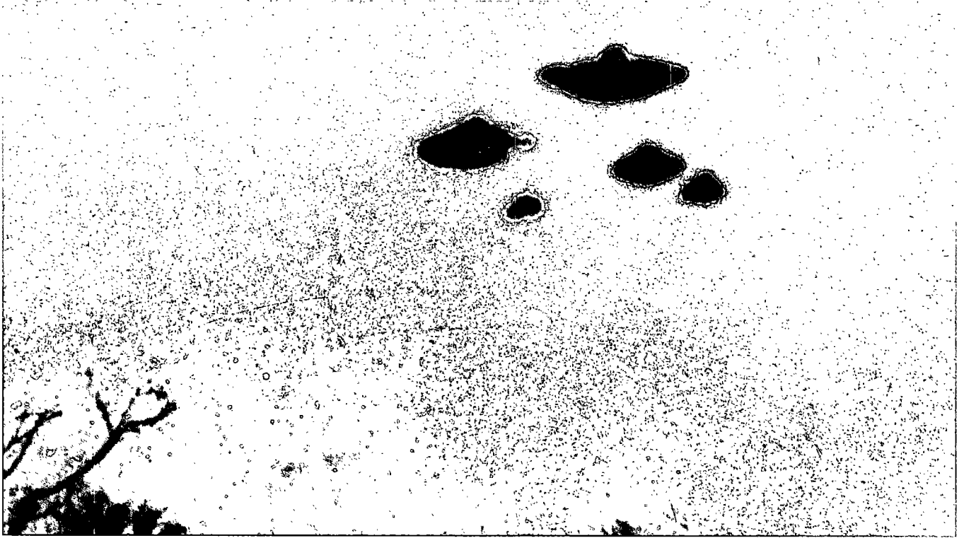
Sheffield, England, 4 March 1962