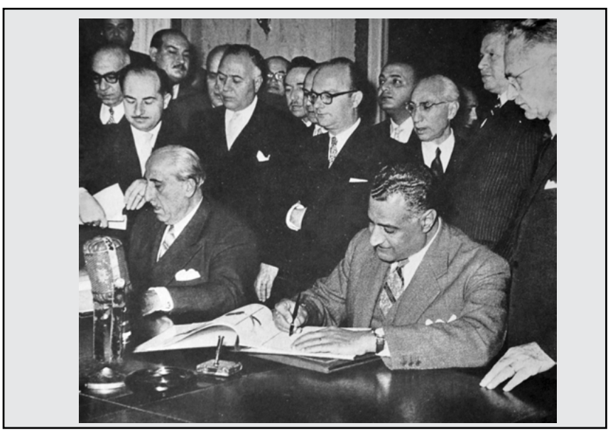
Gamal Abd al Nasser, nearest to the camera, and Syrian President al-Quwaiti sign the agreement creating the UAR on 1 February 1958.

The news of the merger on 1 February was met with massive crowds