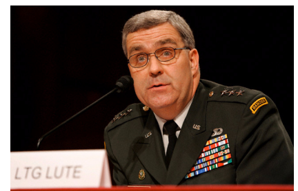
Lt. Gen. Douglas Lute during his confirmation hearing, June 2007.

advise the President with respect to the integration of domestic, foreign, and