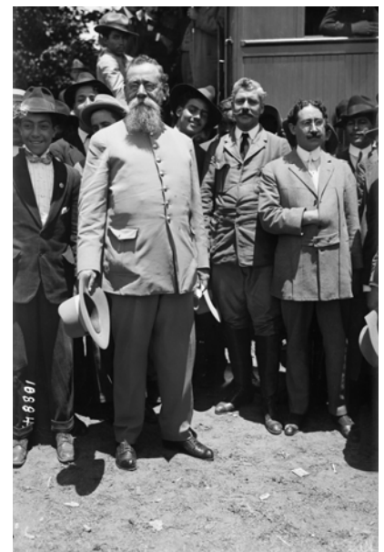
Venustiano Carranza, the leader of the Constitutionalists.

Although Wilson did not trust reporting from businessmen with interests in Mexico because of their biases, he did