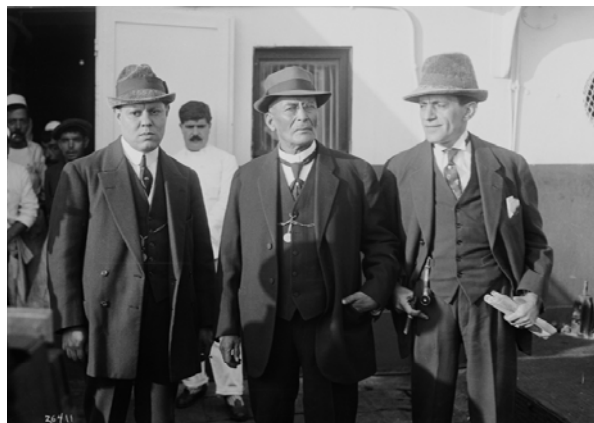
Gen. Victoriano Huerta (center) on his arrival in New York City.