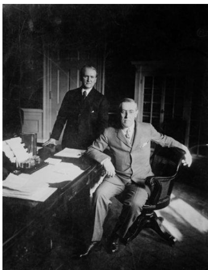
President Wilson (seated) with his private secretary, Joseph Tumulty, a key gatekeeper in passing information to the president.

regions and promoted US businesses in their area.