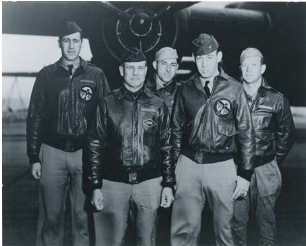
Lt. Col. Jimmy Doolittle (second from left) and the crew of the plane he piloted in the raids over Tokyo on 18 April 1942.

Cunningham, who headed Naval and Marine forces on Wake Island and was captured when that island was attacked immediately after the attack on Pearl Harbor. Four of the famous Doolittle fliers also were found. Captured after their one-way, April 1942 raid on Japan, these were the only survivors of the eight crew members originally taken prisoner. Treated as war criminals, they had been tortured, starved, and kept in solitary confinement. Three were executed, and a fourth died of starvation and disease. Of the four who remained, one was so near death from beriberi that he couldn't be included in the first group of POWs flown out. Lapsing in and out of consciousness, and becoming increasingly psychotic, he was treated by Jarman in a hotel room converted to hospital use until he became sufficiently stable to be moved to Kunming. 15