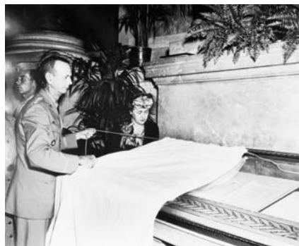
Gen. Jonathan M. Wainwright (1883–1953) unveils surrender documents at US National Archives exhibit, September 12, 1945.

Lamar found the two in a nearby shack, stripped and kneeling on the floor, surrounded by Japanese with bayonets; then he, too, was grabbed, slapped around, bruised by the flat