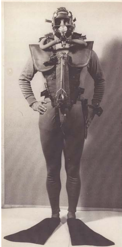
Diver wearing "Lambertsen's Lung."

He also was awarded a Bronze Star and the Purple Heart.