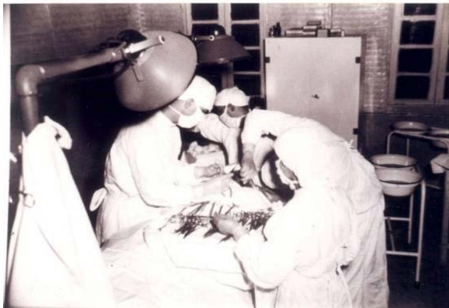
Nazira hospital operating room.