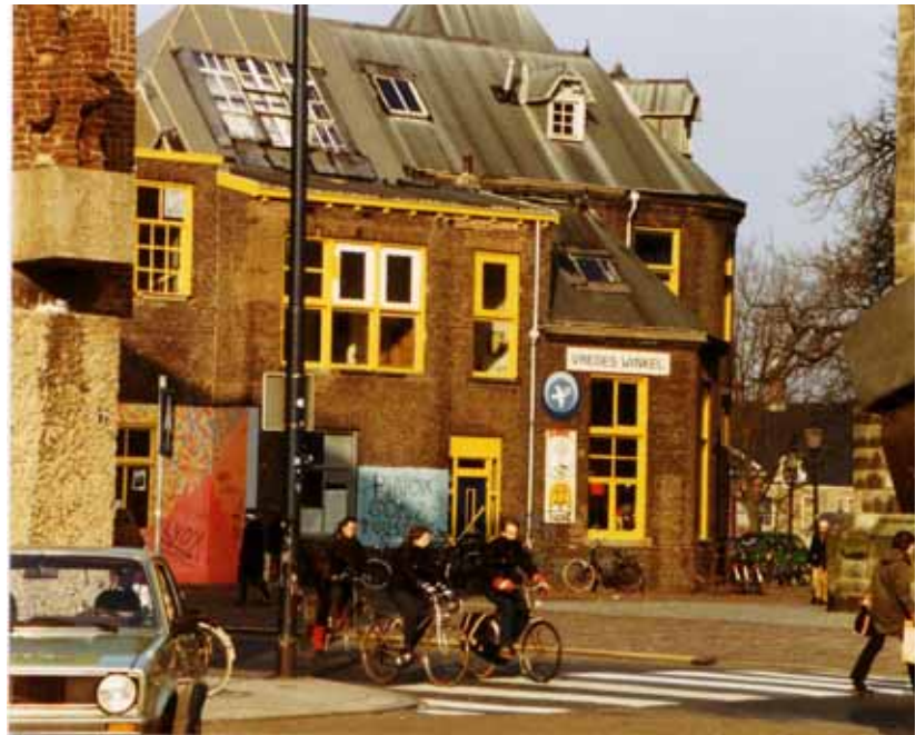
The Peace Shop, on the corner, in Groningen.

Nevertheless, MfS surveillance continued. HA XX ordered