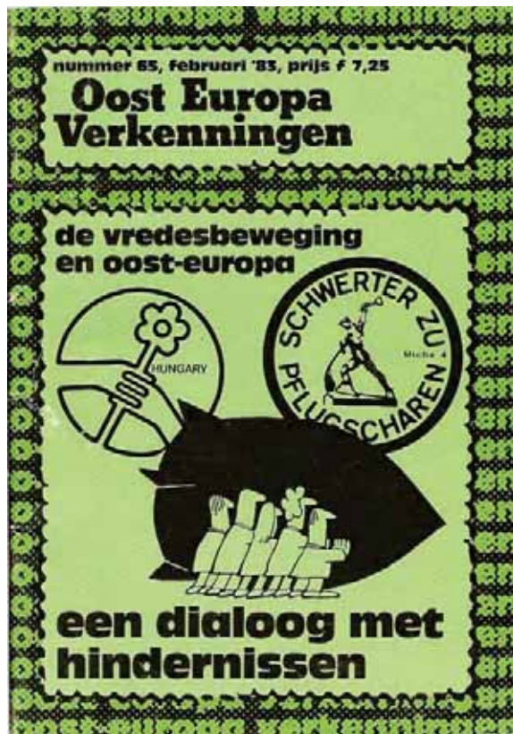
A leaflet of the IKV illustrating the cooperation between it and East German and Hungarian organizations.