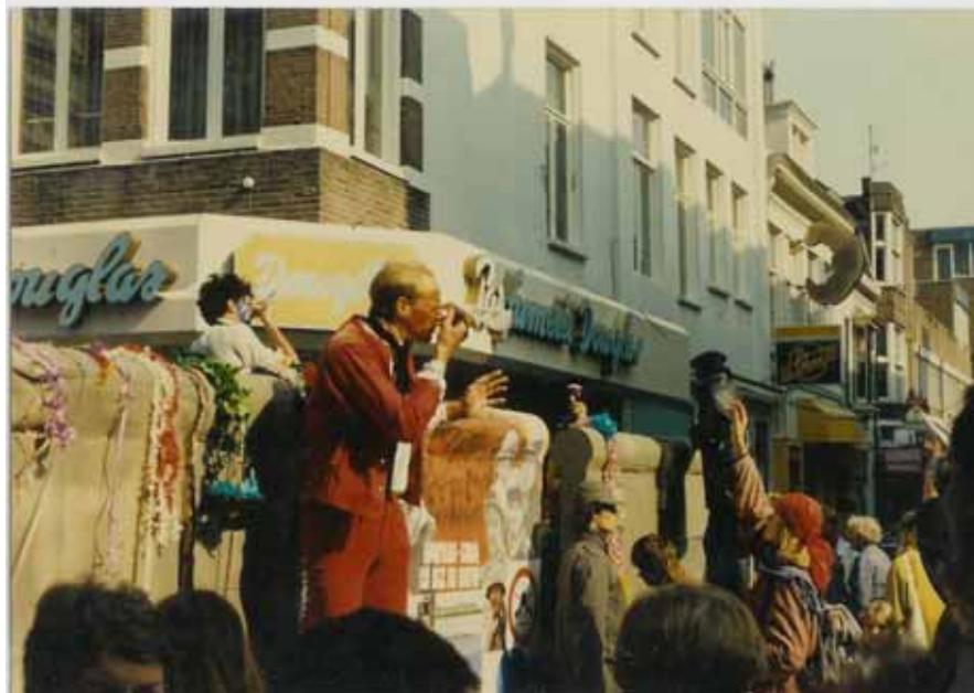
Demonstrators by a cardboard “Berlin Wall” built through Groningen in 1987.

Notwithstanding such threats, the Peace Shop organized a protest against East German border controls in 1987, building a model Berlin Wall of cardboard boxes through Groningen and drawing media attention to the condition of their dissident friends in the GDR. Although the peace