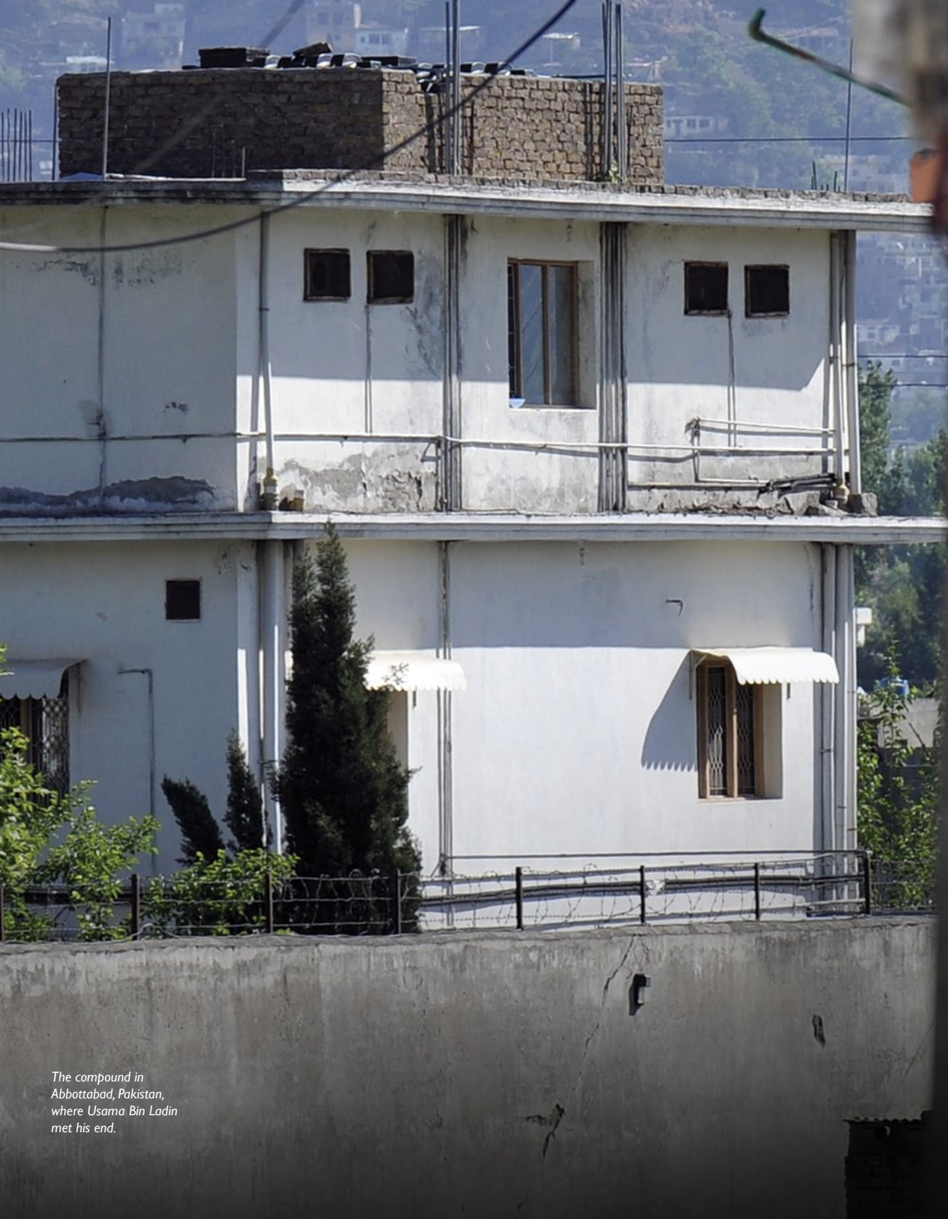
The compound in Abbottabad, Pakistan, where Usama Bin Ladin met his end.

“ May the fact that Usama Bin Ladin no longer inhabits the earth be a source of comfort for the thousands of families, here in America and around the globe, who mourn the victims of al-Qa'ida's barbarity.”