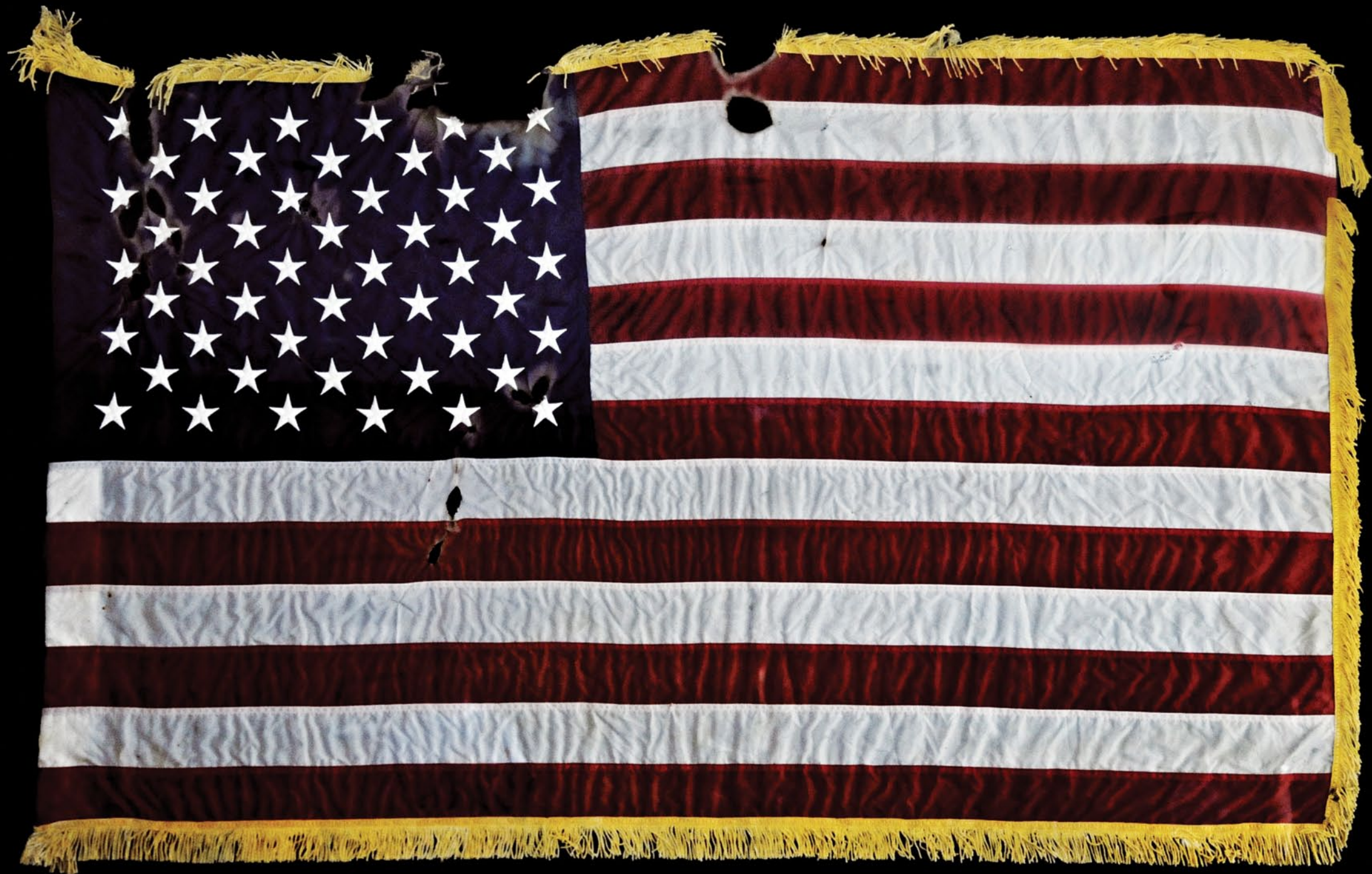
This scorched and tattered flag, recovered from the debris of Ground Zero, hangs in the Office of the Director of CIA. It is a constant reminder of the strength and durability of the nation we serve.

September 11th had a profound effect on our country and our institutions, including the Central Intelligence Agency. We are still guided by the same mission to protect America — yet we have adapted and evolved to meet the range of challenges posed by al-Qa'ida and its violent allies.